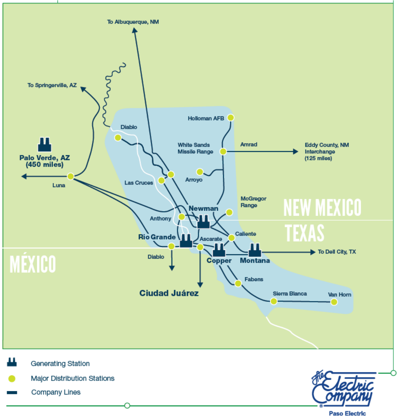
Figure 2 - EPE Service Territory and Electric System

The EPE service territory extends from west Texas to south-central New Mexico as illustrated in Figure 2 below. Copper, Rio Grande, and Newman Power Stations are located in the El Paso area. The Palo Verde Generating Station is located west of Phoenix, Arizona.